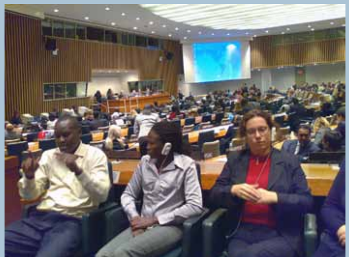
Conference interpretation. Ugandan and Finnish sign language interpreters in the UN in November 2008

Visit The Community Rehabilitation and Disability Studies Program (CRDS): http://www.crds.org/index.shtml