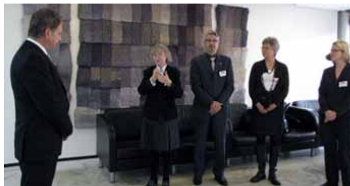
WFD and FAD representatives handing a petition to the Finnish Speaker of the Parliament Mr Sauli Niinistö (left).