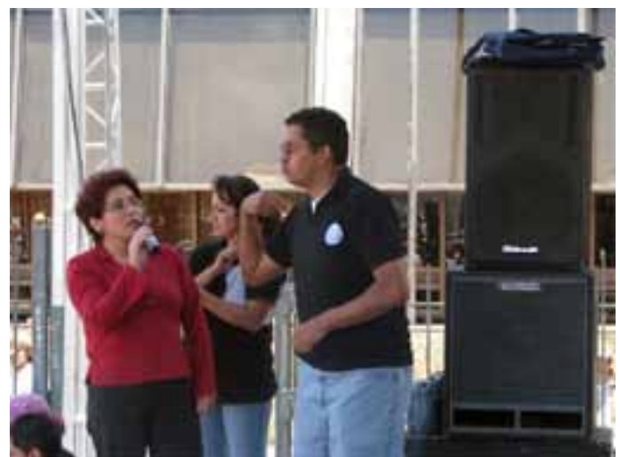
Advocacy campaigning in Ecuador