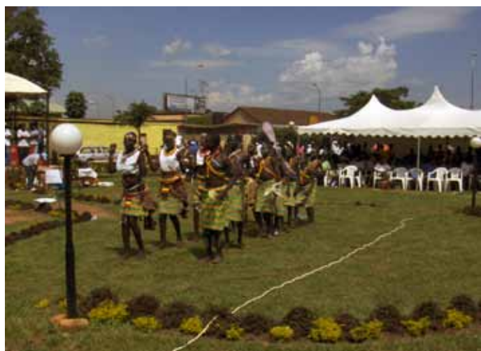
Cultural performances from different districts of Uganda.