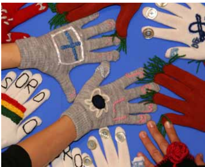
Each Finnish Member of Parliament received a pair of gloves that were decorated by Deaf community