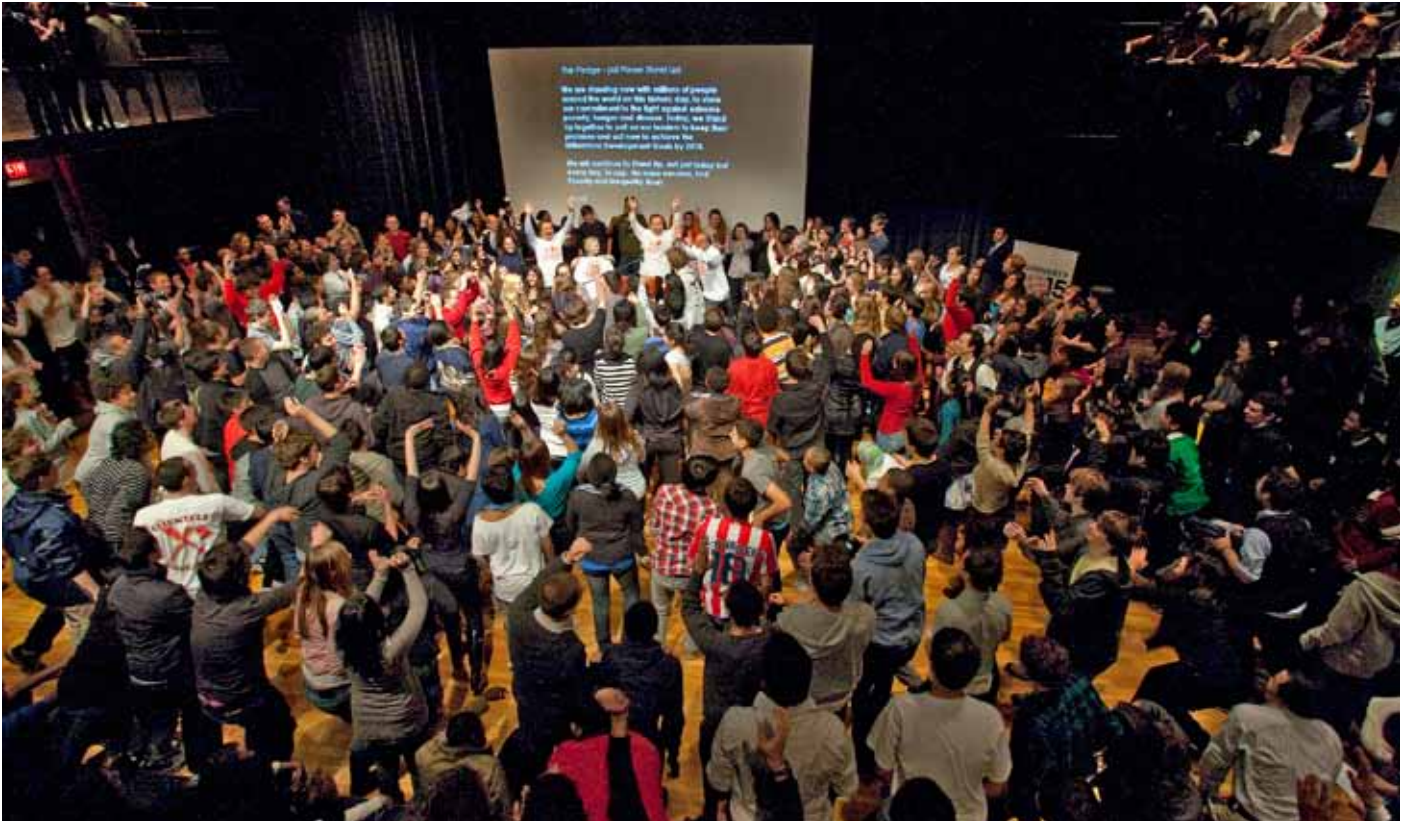
UN Secretary-General Ban Ki-moon (front of screen, white t-shirt) leads students from the United Nations International School (UNIS) in standing up at the end of a pledge they recited to end world poverty, as part of the Stand Up Against Poverty campaign. The campaign urges world leaders to meet the Millennium Development Goals by their 2015 deadline. Date: 16 October 2009