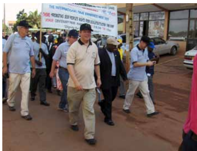
WFD Board joined the Ugandan Deaf March in Kampala

students. Private schools are expensive so most deaf children in Uganda either struggle in government schools that have few resources to support them; or they stay at home.