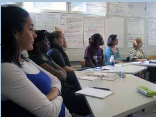
Training session in Helsinki